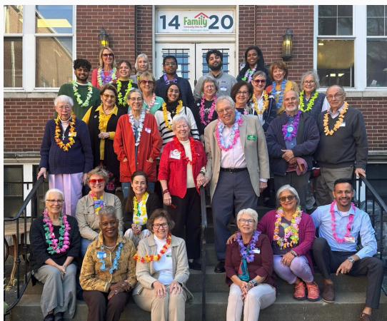
2024 Volunteers Luncheon